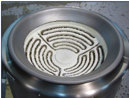
Heating Element with Kettle Ring